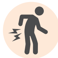
LOWER BACK PAIN