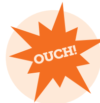
PAIN WHEN WEEING