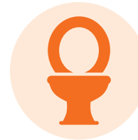
FREQUENT NEED TO WEE